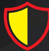
OPTICALLY CLEAR PROTECTION

So while a vinyl wrap may offer some level of paint protection, it is typically installed for aesthetic or marketing purposes, because shipping trucks are basically rolling billboards, right? In contrast, a PPF is going to either be a matte-like armor, or if transparent, a see-thru shield that allows glossy painted surfaces to safely shine underneath.