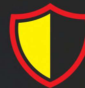
STAIN RESISTANCE TECHNOLOGY